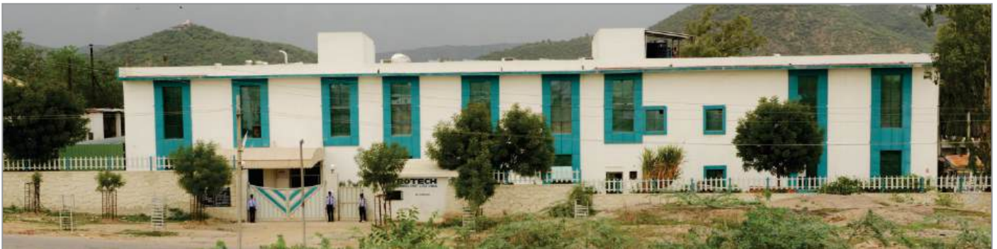
PYROTECH ELECTRONICS PVT. LTD. - UNIT IV

Pyrotech Electronics Pvt. Ltd was established in 1976 at Udaipur, Rajasthan having more than 35 years experience in Turnkey control room interiors, Mosaic Panels & Desks, Control Panels & Desks, other Industrial Panels, Junction Boxes & Racks and more than 10 years experience of Supply, Installation & Commissioning in video wall market. We have our reach to the Power, Energy G/D/T, Oil & Gas, Metal, Transport, Defense & Cement industries etc. .