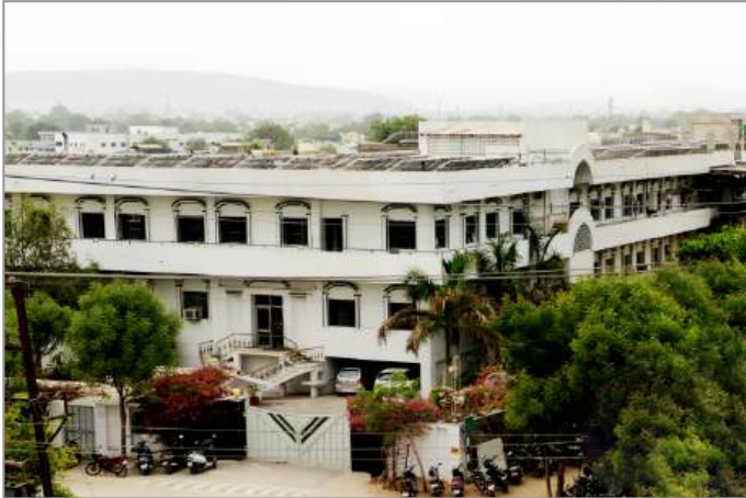
PYROTECH ELECTRONICS PVT. LTD. - UNIT II