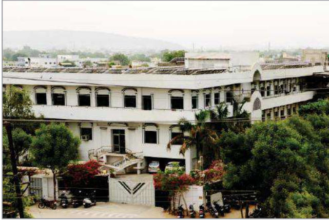
PYROTECH ELECTRONICS PVT. LTD. - UNIT II