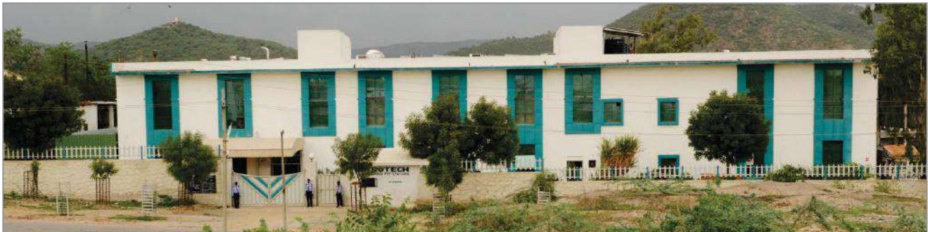
PYROTECH ELECTRONICS PVT. LTD. - UNIT IV

Pyrotech Electronics Pvt. Ltd was established in 1976 at Udaipur, Rajasthan having more than 35 years experience in Turnkey control room interiors, Mosaic Panels & Desks, Control Panels & Desks, other Industrial Panels, Junction Boxes & Racks and more than 10 years experience of Supply, Installation & Commissioning in video wall market. We have our reach to the Power , Energy G/D/T, Oil & Gas, Metal, Transport, Defense & Cement industries etc. .